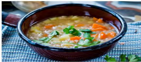
BARLEY SOUP 1L-$12