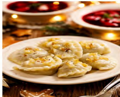
PIEROGIES 12-$11 Potatoes and cheese