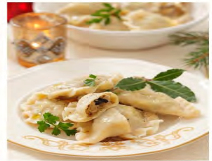
PIEROGIES 12-$11 Sauerkraut and mushrooms